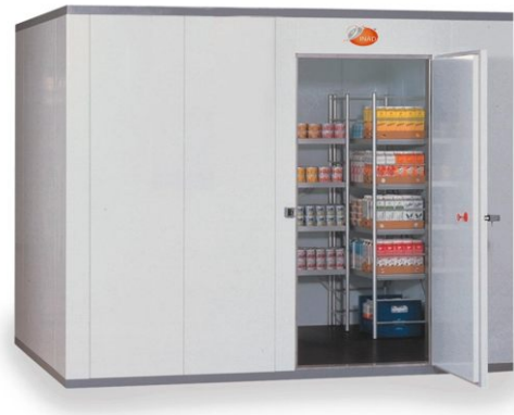
Cold Room and Blast Freeze