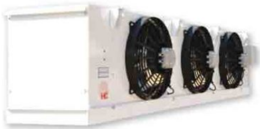
Evaporative Cooling Unit